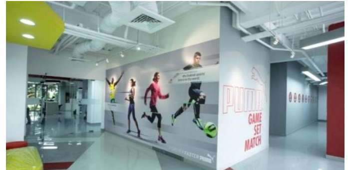
( PUMA Office – Inside Industrial Building )