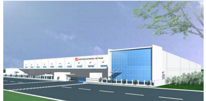
( Nippon Express Vietnam – Logistic Facility )