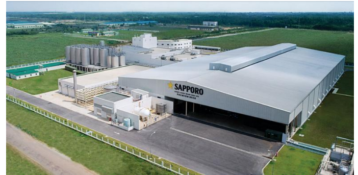
( The Sapporo Vietnam Brewery Factory – Long An )