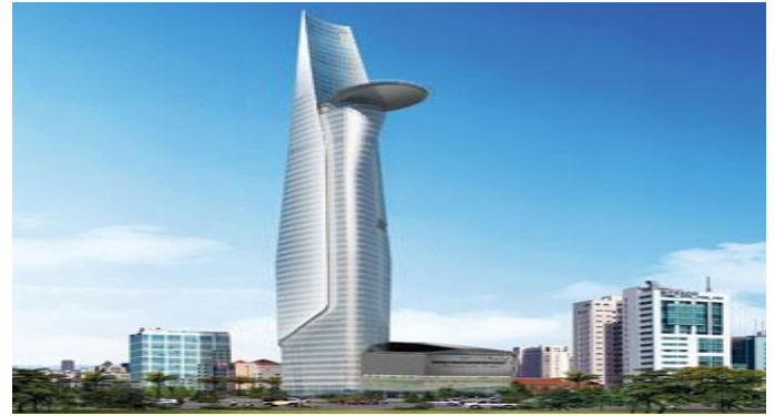
( Bitexco Financial Tower )

The system is further complemented with an ideal state-of-the-art time management programming solution that promises uniform excellence in allowing the correct entry to personnel when prompted, while declining access to intruders.