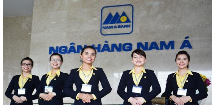
( Nam A Bank Branch in Tan Binh )