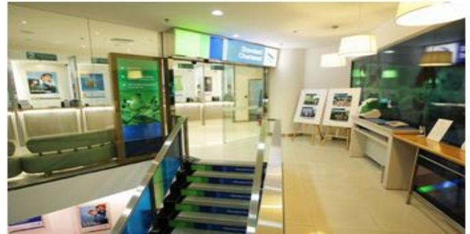
( Standard Chartered Bank - Saigon Trade Center )