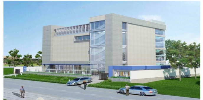
( Eximbank Data Center - Binh Duong )